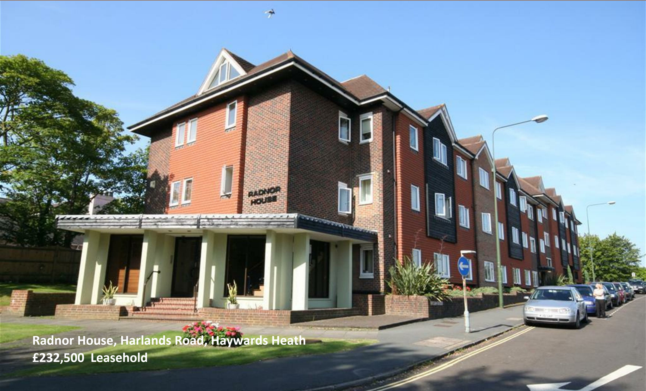
Radnor House, Harlands Road, Haywards Heath £232,500 Leasehold