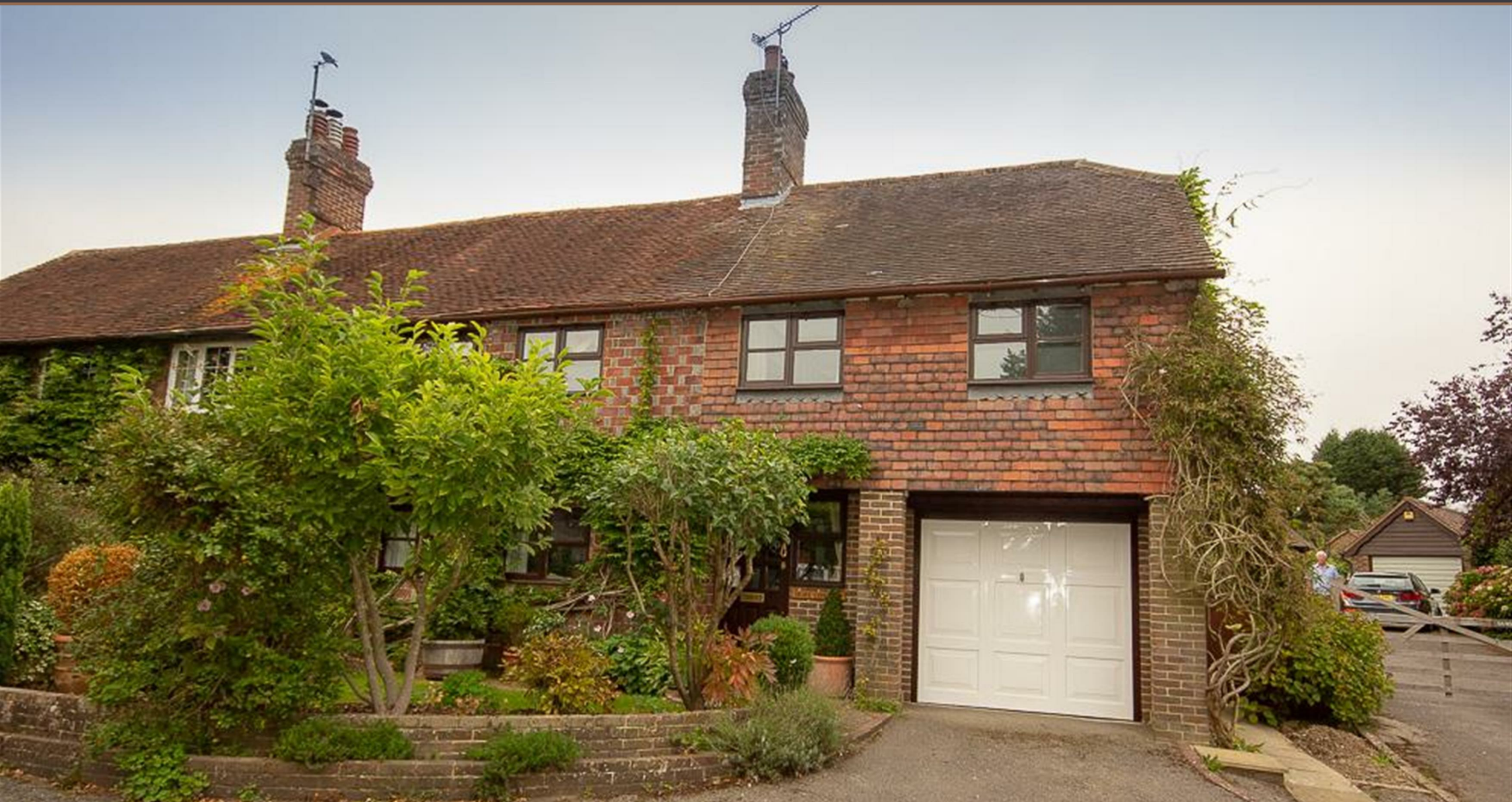
Hope Cottage Horsted Lane, Haywards Heath, RH17 7HP