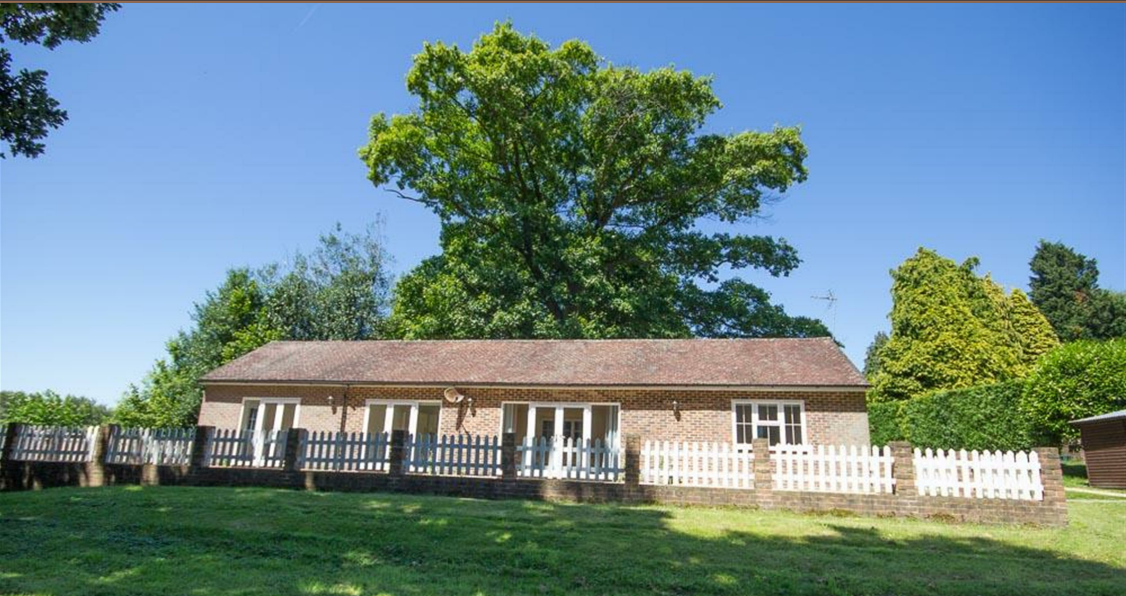
Woodland Cottage Wallage Lane, Crawley, RH10 4NJ