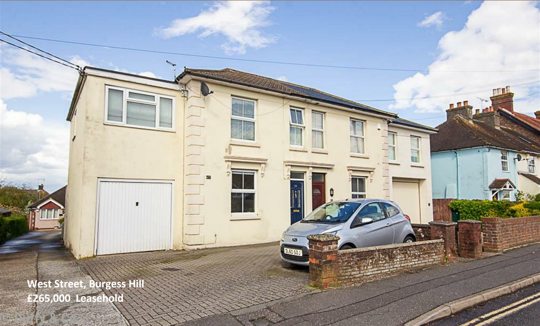
West Street, Burgess Hill £265,000 Leasehold